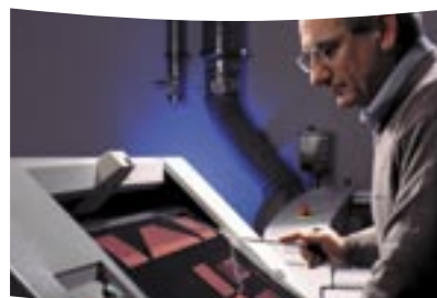
Cyrel® Digital Imager